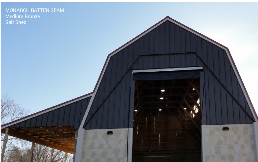
MONARCH BATTEN SEAM Medium Bronze Salt Shed