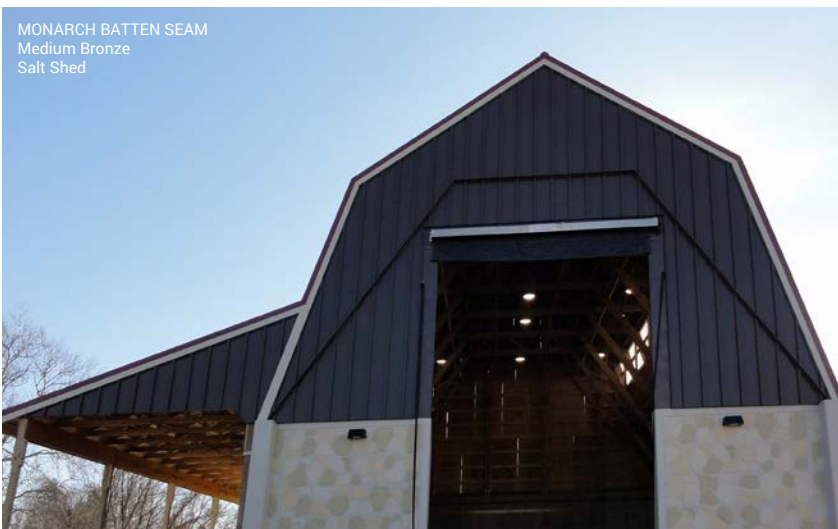
MONARCH BATTEN SEAM Medium Bronze Salt Shed