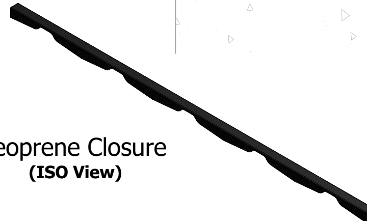
Neoprene Closure (ISO View)