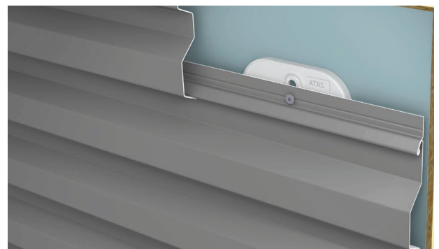
SPACER SHIM | WALL APPLICATION