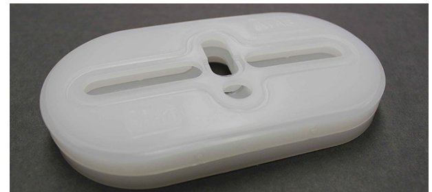
STACKABLE FOR MAXIMUM EFFICIENCY 3/8" SINGLE | 3/4" DUAL STACK