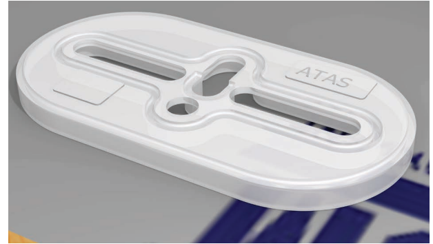
ATAS INTERNATIONAL'S PATENTED SPACER SHIM